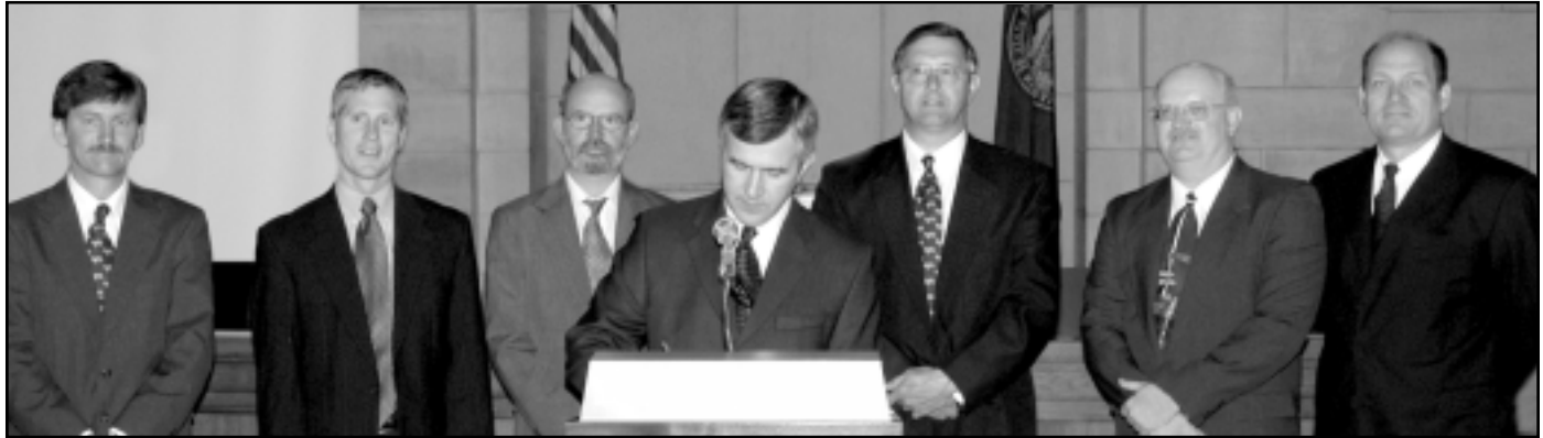
Governor Mike Johanns signed a proclamation April 21, declaring May 2-8 National Drinking Water Week in the State of Nebraska.